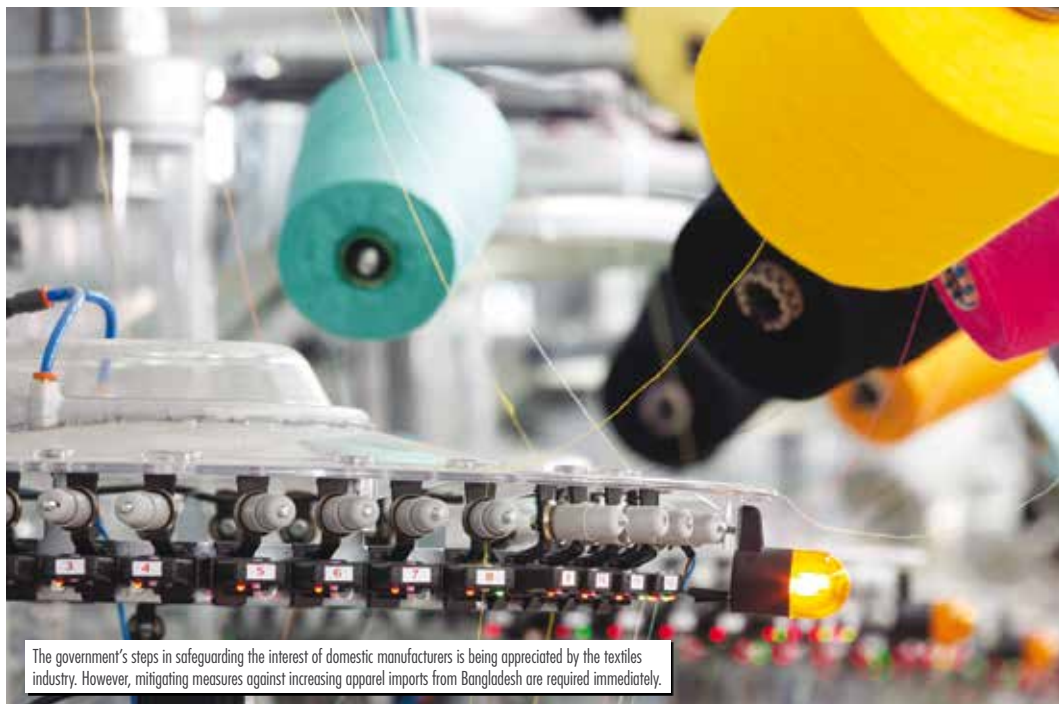
The government's steps in safeguarding the interest of domestic manufacturers is being appreciated by the textiles industry. However, mitigating measures against increasing apparel imports from Bangladesh are required immediately.

Last year, on October 27, the government had increased the import duty on various categories of man-made fabrics from 10 per cent to 20 per cent. Weavers based in Surat, the country's largest man-made cluster were elated over the government's decision as this would make domestic manufacturers competitive against products imported from China and other countries. However, many HS Codes in the man-made category were left out through which imports may still be continuing. Currently, most of the Indian designer brands source fabrics and other textile items from countries like China because of their lower prices and high quality.