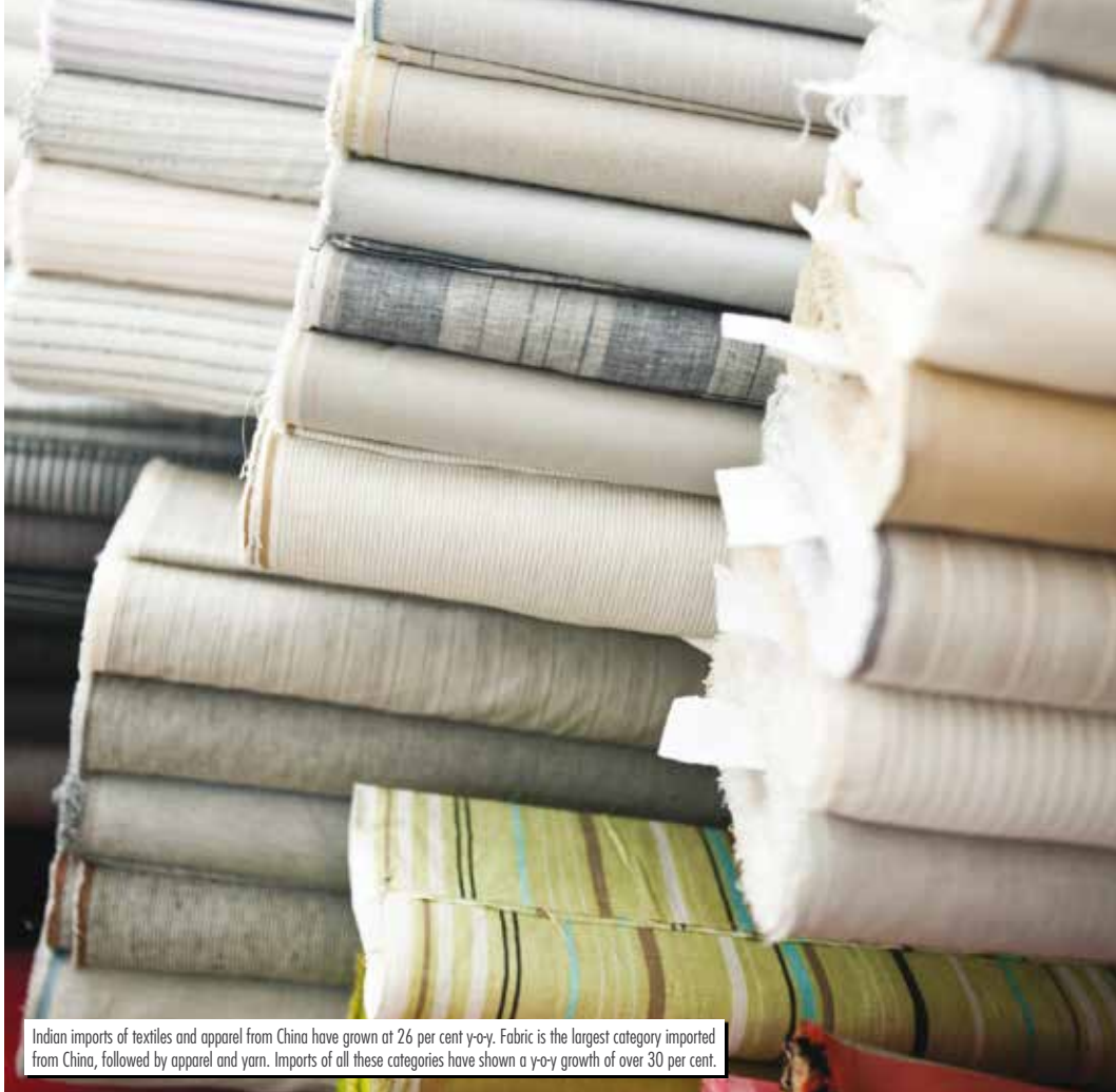
Indian imports of textiles and apparel from China have grown at 26 per cent y-o-y. Fabric is the largest category imported from China, followed by apparel and yarn. Imports of all these categories have shown a y-o-y growth of over 30 per cent.

It is noteworthy to mention that apparel imports from Bangladesh has also increased from $140 million in 2016-17 to $210 million at a rate of 44 per cent. Bangladesh's apparel products enjoy duty-free access to the Indian market.