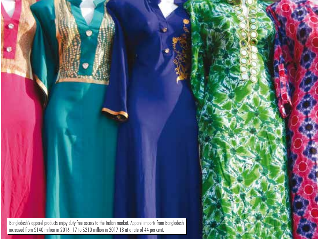
Bangladesh's apparel products enjoy duty-free access to the Indian market. Apparel imports from Bangladesh increased from $140 million in 2016-17 to $210 million in 2017-18 at a rate of 44 per cent.

Thereafter, during July and August this year, the government doubled the import duty on as many as 400 textiles and apparel products to 20 per cent to boost local manufacturing. Earlier, the import duty was 10 per cent. A majority of the products on which import duties were hiked were from the apparel category. This move is a welcome step as it would give an edge to domestic garment manufacturers as imported products will be costlier. An increase in manufacturing activity will also create jobs in the sector, which is one of the largest employers in the country. The textiles industry in the North has expressed relief over the hike in import duties of major textiles and apparel products. On the other hand, they are also worried about the issue of rising garment imports from Bangladesh.